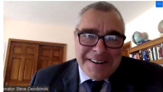
Senator Steve Cwodzinski