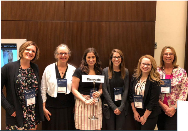
Nutrition and Dietetics Advocacy Summit 2019

We are busy advocating for pro-nutrition legislation throughout the year!