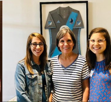
ANDPAC event for U.S. Rep. Betty McCollum 2019