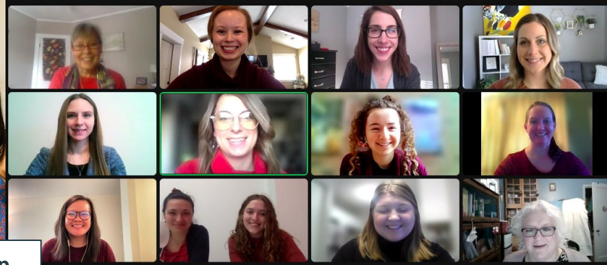
Nutrition and Dietetics Advocacy Summit 2022